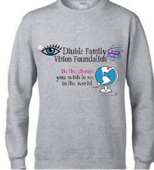
TSHIRT LS- 20