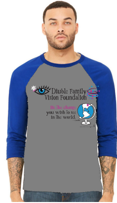
BELLA RAGLAN $25