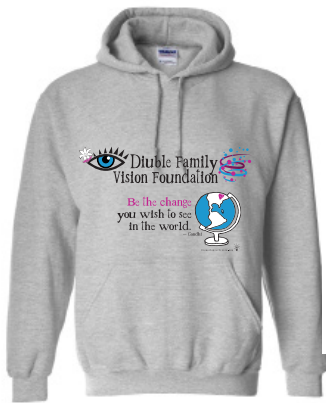
HOODIE - $30