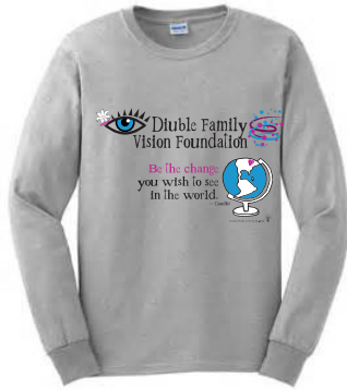
CREW - $25