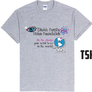
TSHIRT - $15